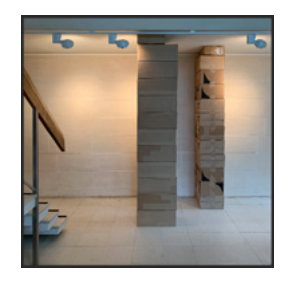
Balcony Screen Object 2019–20 aluminium frame, wax, timber, blind fabric installed size variable

Undercroft Mediation Photowork 2019 digital print on rag paper, mounted on aluminium 80 x 80 cm