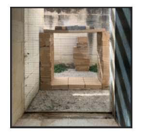
Ensuite Object 2019–20 stainless steel tray installed size variable

CE: Yes, I think it was very much about me focusing on my perceptions and my experience and translating that into the space. So, it kind of felt at times I must admit, with coming in on the Mondays, see there's kind of a bit of a, I'm trying to think of the right word, not transitional ... as though I was enforcing my will on the space; there is a certain amount of that when you exhibit in a space of course. The boxes are an expression of that, of placing my will in the place and trying to materialise my thoughts. It's not to counter any other history that's here, but it's just to stabilise my thoughts in the space. Not all of the structures were monumental, but I can say, for example, that the photograph here, of the large installed box structure, there was actually a work in behind those boxes when we took the photograph. There's a certain amount of fragility in that monumental action with the boxes going on during that habitation process. And being, I dunno, assertive, I didn't feel like I should take those cushions out