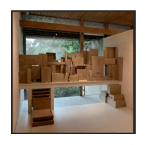
Study Mediation Photowork 2019 digital print on rag paper, mounted on aluminium 80 x 80 cm

Study Object 2019–20 cast aluminium plates, timber stud 5 elements installed size variable