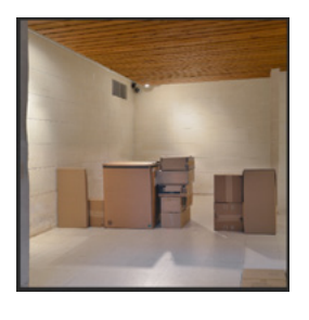
Kitchen Mediation Photowork 2019 digital print on rag paper, mounted on aluminium 80 x 80 cm

It's been such a long project for me. Lesley, you