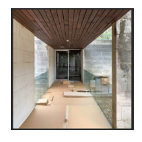
Entrance Mediation Photowork 2019 digital print on rag paper, mounted on aluminium 80 x 80 cm

After spending time 'inhabiting' the building and making ephemeral installations in each of its seven rooms, Eskdale has developed a sculptural language of motifs and forms specific to its character and history. This in-situ work and documentation is incorporated into the exhibition itself, as she explores the interstices between private and public life, and the overlap between the studio and the gallery.