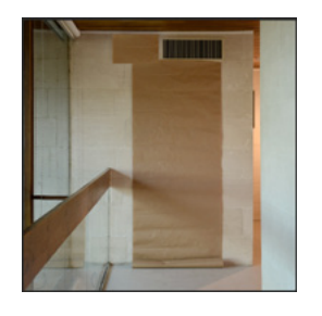
Corridor Mediation Photowork 2019 digital print on rag paper, mounted on aluminium 80 x 80 cm

LH: Let's open up to the audience for comments and questions now.