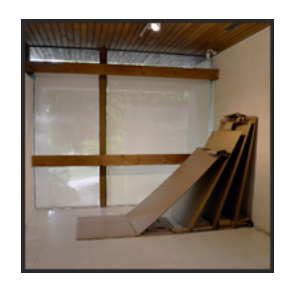
Bedroom Mediation Photowork 2019 digital print on rag paper, mounted on aluminium 80 x 80 cm

Bedroom Screen Object 2019–20 aluminium frame, timber, blind fabric installed size variable