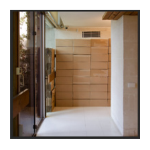
Laundry Object 2019–20 Mount Gambier limestone blocks, latex 77 x 200 x 30 cm

Laundry Models 2019–20 hardwood installed size variable