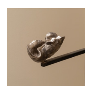
Powder Room Object (detail) 2019–20 steel, cast bronze 27 x 35 x 97cm

Powder Room Object 2019–20 steel, cast bronze 27 x 35 x 97cm