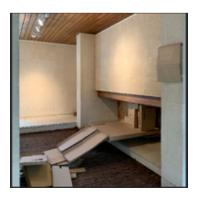
Conversation Pit Mediation Photowork 2019 digital print on rag paper, mounted on aluminium 80 x 80 cm

I'm curious about the fact that while I know you