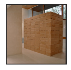
Lounge Mediation Photowork 2019 digital print on rag paper, mounted on aluminium 80 x 80 cm

CE: Yeah, I guess I'm very interested in stability. So, for example one of the last things I did, like yesterday, there was an issue about these supports— they do hold it vertical, by the way, however they might look—, about whether or not to have four or three. I had to go with three because it's too stable if it's four, it has to feel still in process. So ... it's in that. I guess, maybe it's life, isn't it, I mean life is not stable, it's ... I don't enjoy works that are too fixed. I'm always trying to have the sense that they're at that moment of change, in progress, of becoming and not becoming, like