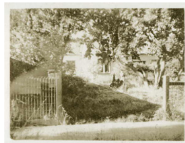
Boyd's House c.1945 gelatin silver photograph 4 x 5 cm Albert Tucker Photograph Collection Heide Museum of Modern Art and State Library Victoria Gift Barbara Tucker 2008