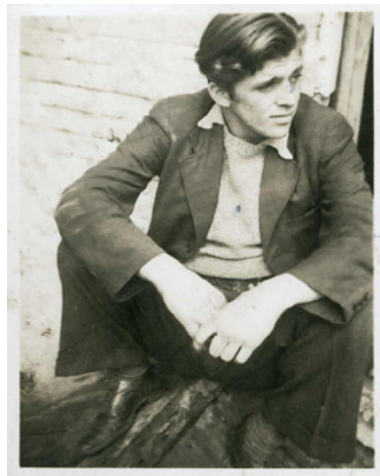
Matcham Skipper c.1939 gelatin silver photograph 5 x 4 cm Albert Tucker Photograph Collection Heide Museum of Modern Art and State Library Victoria Gift of Barbara Tucker 2008