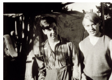
Arthur Boyd and John Perceval 1943 gelatin silver photograph 30.3 x 40.3 cm Heide Museum of Modern Art Gift of Barbara Tucker 2001