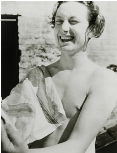
Yosl Bergner c.1940 gelatin silver photograph 40.4 x 30.5 cm Heide Museum of Modern Art Gift of Barbara Tucker 2001