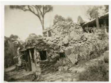
Stonygrad 1944 exhibition print from original gelatin silver photograph 29.7 x 42 cm