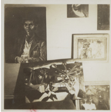
47 Robe St. St Kilda 1945

born 1914 Melbourne, Victoria. Lived and worked Melbourne. Died 1990