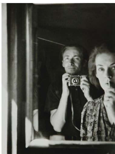
In the Mirror: Self Portrait with Joy Hester 1939 gelatin silver photograph 40.1 x 30.4 cm Heide Museum of Modern Art Gift of Barbara Tucker 2001