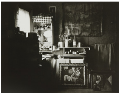
Interior with 'Image of Modern Evil: Spring in Fitzroy' 1943 gelatin silver photograph 30.3 x 40.4 cm Heide Museum of Modern Art Gift of Barbara Tucker 2001