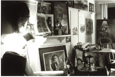
Interior with 'Man's Head' 1946 gelatin silver photograph 30.4 x 40.3 cm Heide Museum of Modern Art Gift of Barbara Tucker 2001