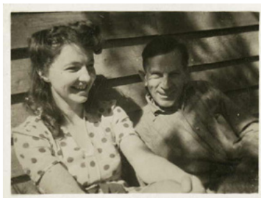
Untitled 1944 gelatin silver photograph 4 x 5 cm Albert Tucker Photograph Collection Heide Museum of Modern Art and State Library Victoria Gift of Barbara Tucker 2008