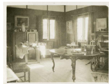
Boyd's Dining Room Jan 1943 exhibition print from original gelatin silver photograph 29.7 x 42 cm