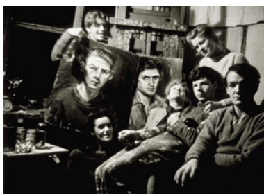
Arthur Boyd's Studio c.1945 gelatin silver photograph 30.4 x 40.2 cm Heide Museum of Modern Art Gift of Barbara Tucker 2001