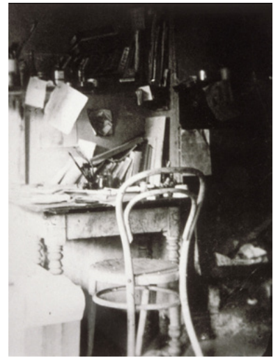
The Studio, 26 Little Collins Street, Melbourne c.1939 gelatin silver photograph 20 x 16 cm Heide Museum of Modern Art Gift of Barbara Tucker 2001