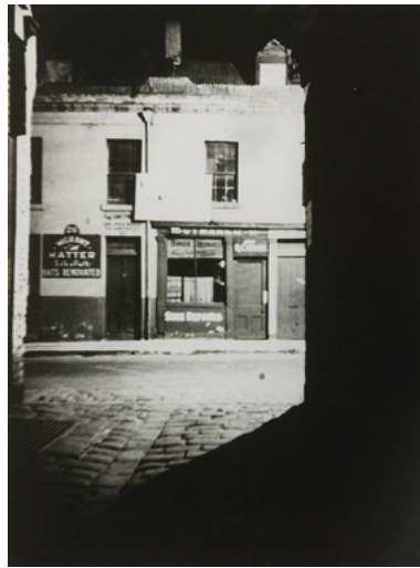
26 Little Collins Street c.1939 gelatin silver photograph 40.4 x 30.5 cm Heide Museum of Modern Art Gift of Barbara Tucker 2001