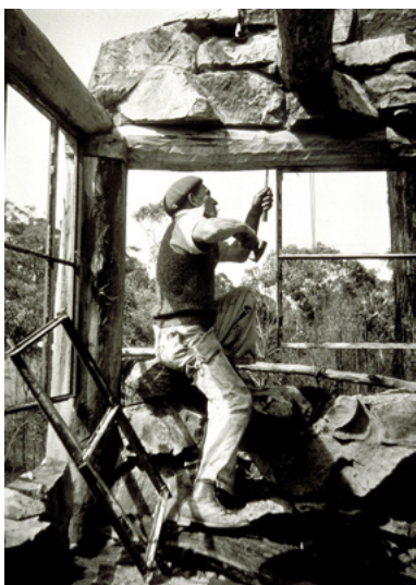
Danila Vassilieff Building Stonygrad 1944 gelatin silver photograph 40.5 x 30.5 cm Heide Museum of Modern Art Gift of Barbara Tucker 2001