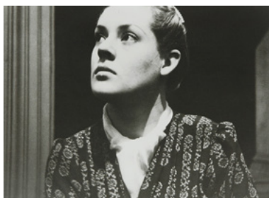
Portrait of Joy Hester c.1943 gelatin silver photograph 30.5 x 40.6 cm Heide Museum of Modern Art Gift of Barbara Tucker 2001