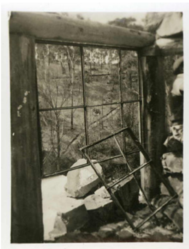
Stonygrad Nearing Completion 1944 exhibition print from original gelatin silver photograph 29.7 x 42 cm