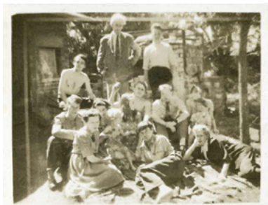
Untitled (Family Group at Open Country) c.1945 exhibition print from original gelatin silver photograph 29.7 x 42 cm Albert Tucker Photograph Collection Heide Museum of Modern Art and State Library Victoria Gift of Barbara Tucker 2008