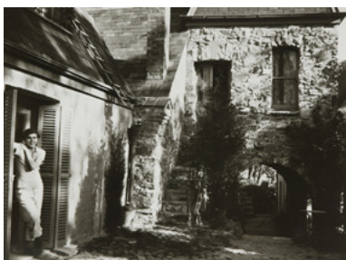
Matcham Skipper c.1943 gelatin silver photograph 30.5 x 40.4 cm Heide Museum of Modern Art Gift of Barbara Tucker 2001