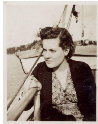
Joy Hester in Sydney 1939 exhibition print from original gelatin silver photograph 42 x 29.7 cm Albert Tucker Photograph Collection Heide Museum of Modern Art and State Library Victoria Gift of Barbara Tucker 2008