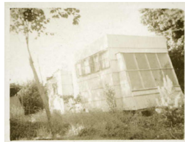
Arthur Boyd's Studio c.1945 gelatin silver photograph 4 x 5 cm Albert Tucker Photograph Collection Heide Museum of Modern Art and State Library Victoria Gift of Barbara Tucker 2008