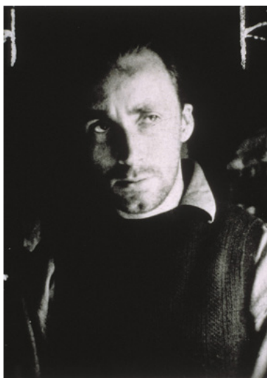
Self Portrait 1940 gelatin silver photograph 40.2 x 30.4 cm Heide Museum of Modern Art Gift of Barbara Tucker 2001