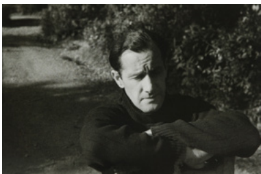
Sidney Nolan 1954 gelatin silver photograph 30.4 x 40.3 cm Heide Museum of Modern Art Gift of Barbara Tucker 2001