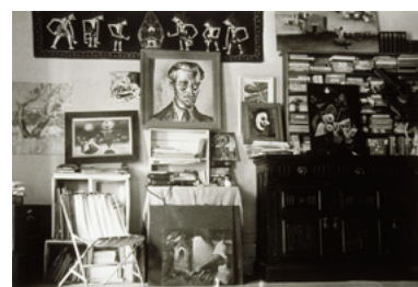
Interior with 'Self Portrait' 1945 gelatin silver photograph 30.4 x 40.2 cm Heide Museum of Modern Art Gift of Barbara Tucker 2001