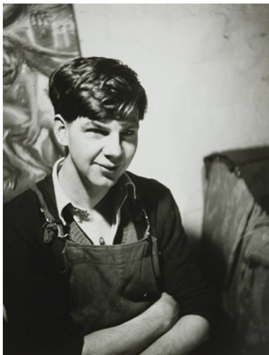
Portrait of Arthur Boyd in his Studio c.1945 gelatin silver photograph 40.6 x 30.6 cm Heide Museum of Modern Art Gift of Barbara Tucker 2001