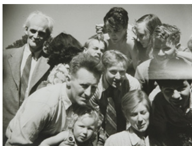
Open Country Group Portrait 1944-45 gelatin silver photograph 30.5 x 40.2 cm Heide Museum of Modern Art Gift of Barbara Tucker 2001