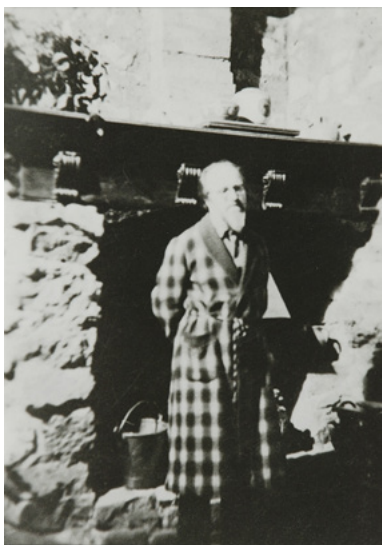
Justus Jorgensen c.1943 gelatin silver photograph 40.5 x 30.5 cm Heide Museum of Modern Art Gift of Barbara Tucker 2001