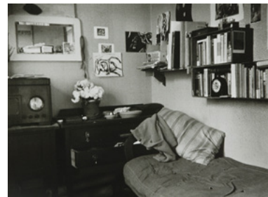
Agnes Street, Jolimont 1943 gelatin silver photograph 30.5 x 40.5 cm Heide Museum of Modern Art Gift of Barbara Tucker 2001