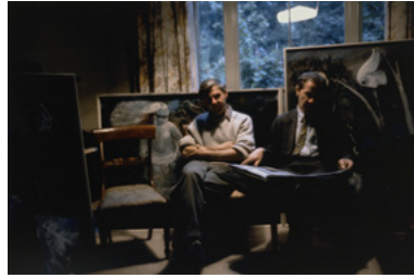
Arthur Boyd and Sidney Nolan, Arthur Boyd's Studio, Hampton Lane, London c.1960 Type C photograph 43.2 x 30.8 cm Heide Museum of Modern Art Gift of Barbara Tucker 2001