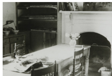
The Dining Room Table c.1945 gelatin silver photograph 30.4 x 40.3 cm Heide Museum of Modern Art Gift of Barbara Tucker 2001