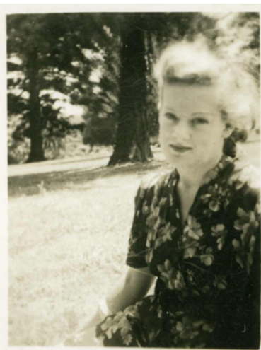
Joy Hester, Fitzroy Gardens 1942 exhibition print from original gelatin silver photograph 42 x 29.7 cm