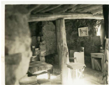
Vassiliev's House Warrandyte c.1944 gelatin silver photograph 4 x 5 cm