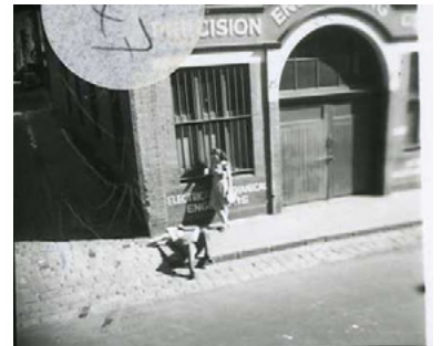
Matcham Skipper and Myra Gould, Little Collins Street, Melbourne c.1940 exhibition print from original gelatin silver photograph 29.7 x 42 cm Albert Tucker Photograph Collection Heide Museum of Modern Art and State Library Victoria Gift of Barbara Tucker 2008