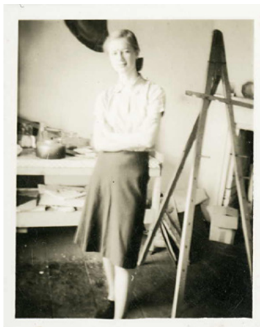
Yvonne Lennie 1942 exhibition print from original gelatin silver photograph 42 x 29.7 cm Albert Tucker Photograph Collection Heide Museum of Modern Art and State Library Victoria Gift of Barbara Tucker 2008