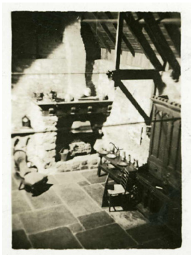
Eltham, Jorgensen's c.1943 exhibition print from original gelatin silver photograph 29.7 x 42 cm Albert Tucker Photograph Collection Heide Museum of Modern Art and State Library Victoria Gift of Barbara Tucker 2008