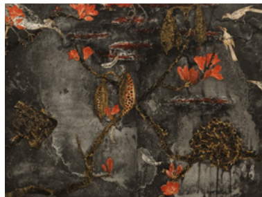
Brachychiton — Nanungguwa 2009–11 etching 69 × 79 cm

born 1953, Sydney, New South Wales. Lives and works Hobart, Tasmania