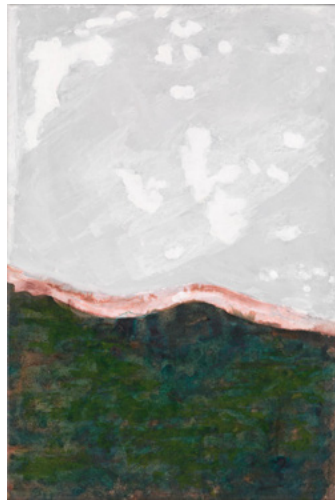
Land and Sky from Sea 2 2005 oxides and ink on canvas 80.4 × 54.2 cm National Gallery of Victoria, Melbourne Purchased with funds donated by Supporters and Patrons of Indigenous Art 2005