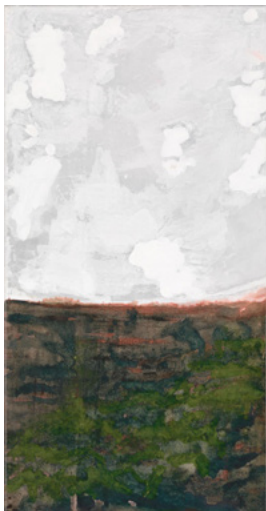
Land and Sky from Sea 1 2005 oxides and ink on canvas 81.4 × 41.4 cm National Gallery of Victoria, Melbourne Purchased with funds donated by Supporters and Patrons of Indigenous Art 2005

born 1965, Naarm/Melbourne, Victoria. Lives and works Nipaluna/Hobart, Tasmania