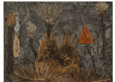
Cycads — Ngathu 2009–11 etching 69 × 79 cm Courtesy of the artist and Roslyn Oxley9 Gallery, Sydney