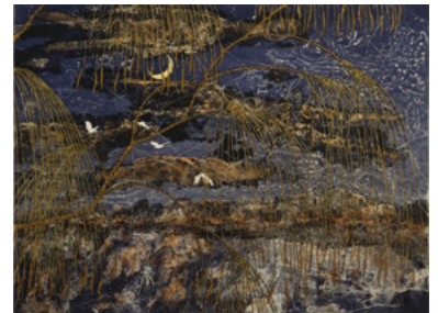
Casuarina — Mawurraki 2009–11 etching 69 × 79 cm