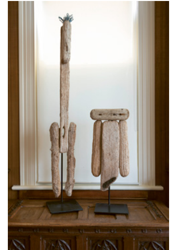
Angels 1990 driftwood left: 145 x 22 x 12 cm, right: 63 x 30 x 5 cm