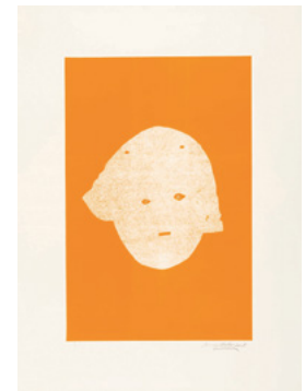
Untitled (Yellow Mask) 2008 monotype 55.3 x 36.3 cm (image) Donated through the Australian Government's Cultural Gifts Program by Murray Walker 2019