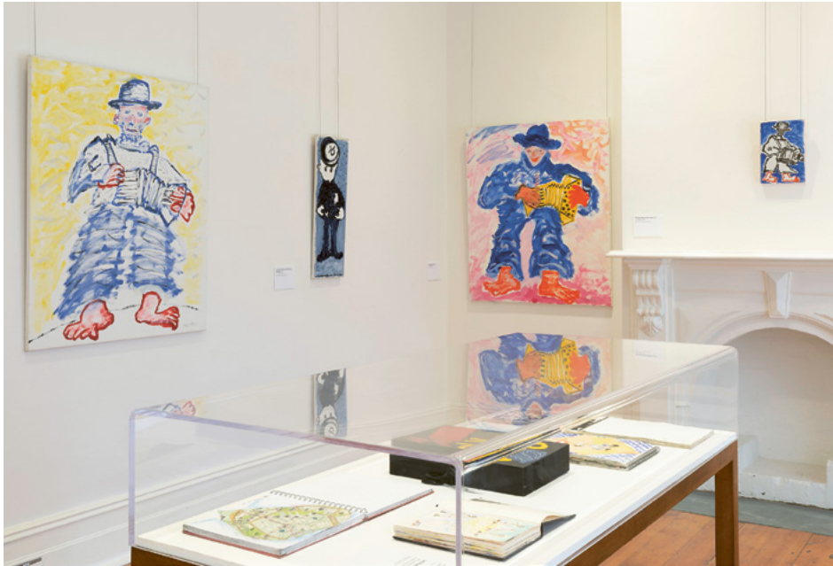
Murray Walker: Walk of Life installation view, 2023