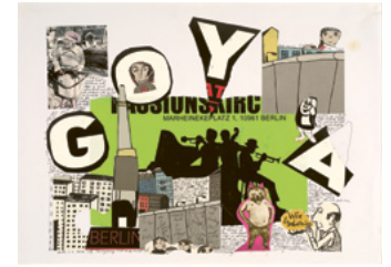
Untitled, from the Berlin Suite 2012 watercolour, crayon, ink and collage on paper 50 × 80 cm Gift of Murray Walker 2014

In the bedroom, a series titled Paris Poor , 2012, is shown for the first time. This suite of paintings is based on one of Walker's multiple trips to Paris, where he observed performers and people of the street—an acute and continued fascination for the artist—with raw emotional sensitivity. The immediate and teeming possibilities of urban life find further resonance in The Berlin Suite , 2012, dynamic and at times deviant collages that traverse the hallway walls. With a mash up of found images, drawn elements and hand-written commentary, Walker's collages encapsulate his experience of the people, politics and pulse of the city with characteristic energy and irreverence.