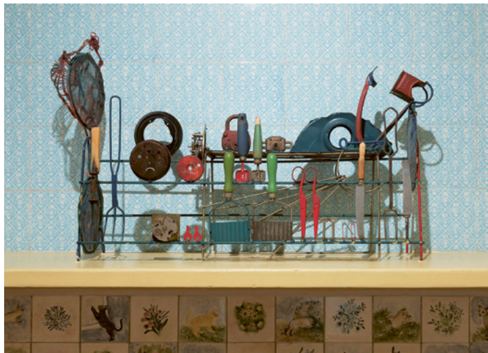
A Homage to John Brack 1995 oil paints on steel 19 x 49 cm Courtesy of the artist and Fox Galleries, Melbourne

Anguish and the universal lived experience are recurring themes for Walker, and these are explored in the dining room. The grouping looks at Walker's use of narrative, the mask as a motif, and investigations of the psyche, together with the direct influence of artists Joy Hester, Edvard Munch and James Ensor. The library, a typical sanctum of quiet contemplation, continues this inquiry through the subjects of memory, spirits and people of the past.