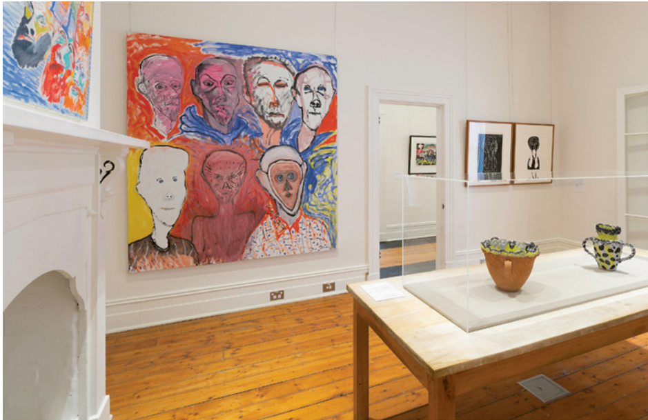
Murray Walker: Walk of Life installation view, 2023