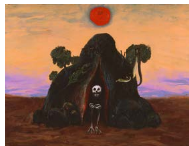
St Anthony in Australia 1987 oil on composition board 91 x 122 cm Heide Museum of Modern Art Gift of the Albert & Barbara Tucker Foundation 2021