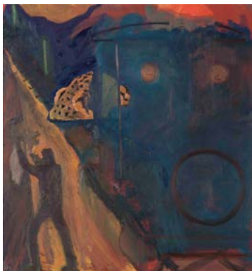
Apparition 2013 oil on canvas 76 x 71 cm