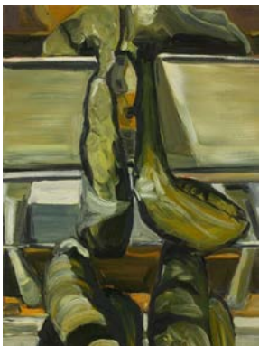
Untitled 2005 oil on canvas 81 x 61 cm Private collection, Melbourne