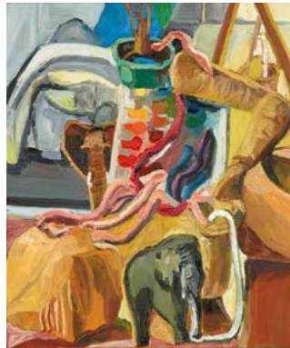
Milk 2008 oil on linen 86.5 x 71.5 cm Art Gallery of New South Wales, Sydney Anonymous gift 2018. Donated through the Australian Government's Cultural Gifts Program