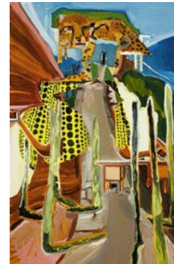
For the Love of Others 2010 oil on canvas 97 x 61 cm Collection of A & R Myer