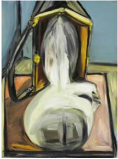
Birth 2003 oil on canvas 55 x 40 cm

born 1973 Guildford, England. Lives and works Melbourne, Victoria