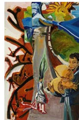
Uncertain Offering 2010 oil on canvas 97 x 61 cm Collection of Tim Newton