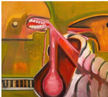
Bite Back 2019 oil on canvas 86.5 x 97 cm Private collection, Melbourne