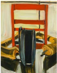
Untitled 2005 oil on canvas 76 x 61 cm Private collection, Melbourne