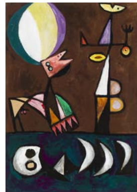
Dog and Moon 1949 ink, gouache and synthetic polymer paint on paper 52.6 x 37.6 cm Heide Museum of Modern Art Gift of Barbara Tucker 2008

born 1914, Melbourne, Victoria. Lived and worked Melbourne. Died 1999