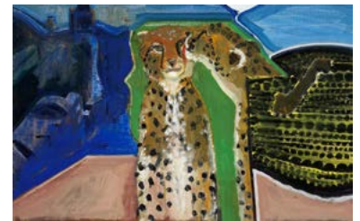
Nurture 2010 oil on linen 61 x 97 cm Collection of Harry and Demetra Xydias