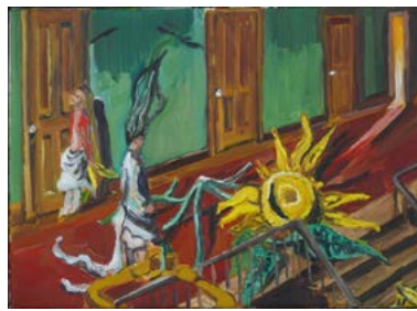
Eine Kleine Nachtmusik 2009 oil on canvas 40 x 56.5 cm Private collection, Melbourne