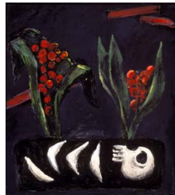
Rebirth 1951 oil on cardboard 51 x 45.7 cm Heide Museum of Modern Art On long-term loan from the Albert & Barbara Tucker Foundation