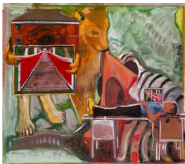
Two Bridges 2022 oil on canvas 107 x 122 cm