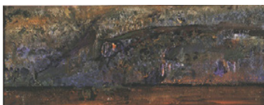
Gold Coast Hinterland I 1971 synthetic polymer paint and gouache on paper image 49 x 55.5 cm; sheet 77 x 55.5 cm Gold Coast City Gallery, Queensland Purchased 1997