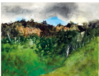
Springbrook Landscape 1974 synthetic polymer paint, watercolour, ink and chalk on paper 51 x 66.5 cm Heide Museum of Modern Art Gift of Barbara Tucker 2008