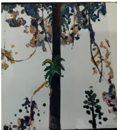
Rainforest, Springbrook II 1971 synthetic polymer paint and gouache on paper image 56.5 x 50.5 cm; sheet 56.5 x 77 cm Private collection, courtesy of Philip Bacon Galleries, Brisbane