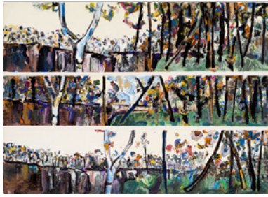
Rainforest Escarpment, Springbrook 1971 synthetic polymer paint and gouache on paper 55.5 x 77 cm Estate of Fred Williams