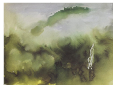
The Falls, Springbrook 1974 synthetic polymer paint and watercolour on paper 29.5 x 39 cm Albert & Barbara Tucker Foundation