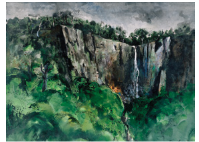
The Falls, Springbrook 1974 watercolour on paper 50 x 65.5 cm Gold Coast City Gallery, Queensland Purchased 2000