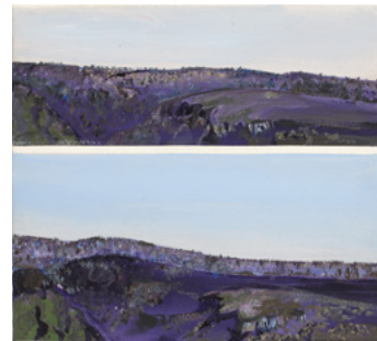
Gold Coast Hinterland II 1971 synthetic polymer paint and gouache on paper image 50.2 x 55.1 cm; sheet 76.3 x 55.1 cm Private collection, courtesy of Philip Bacon Galleries, Brisbane