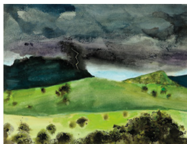
Storm, Springbrook 1974 watercolour and chalk on paper 50.7 x 66.2 cm Albert & Barbara Tucker Foundation