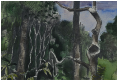
Springbrook 1974 watercolour and pencil on paper 12 x 17.5 cm Gold Coast City Gallery, Queensland Purchased by the Australian Decorative and Fine Arts Society for Gold Coast City Gallery 2014