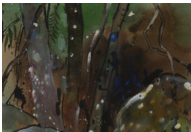
Springbrook 1973 watercolour, ink and charcoal on paper 18 x 26 cm Gold Coast City Gallery, Queensland Purchased by the Australian Decorative and Fine Arts Society for Gold Coast City Gallery 2014