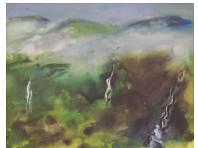
The Falls, Springbrook 1974 synthetic polymer paint and watercolour on paper 29.5 x 39 cm Albert & Barbara Tucker Foundation