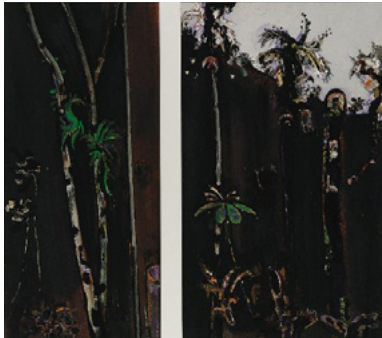
Rainforest, Springbrook I 1971 synthetic polymer paint and gouache on paper image 55.6 x 61.6 cm; sheet 55.6 x 77 cm Gold Coast City Gallery, Queensland Gift of Lyn Williams and the Fred Williams Estate 1997