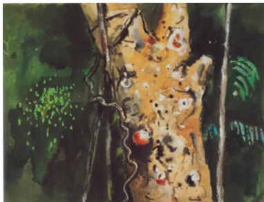
Springbrook 1973 synthetic polymer paint and watercolour on paper 29 x 38.5 cm Albert & Barbara Tucker Foundation