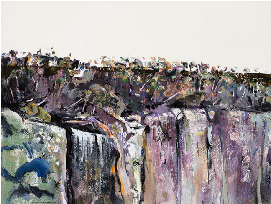
Fred Williams Cliff Face, Springbrook I 1971 synthetic polymer paint and gouache on Arches paper image 40.5 x 55.5 cm; sheet 77 x 55.5 cm Estate of Fred Williams

Albert Tucker and Fred Williams painted the spectacular surrounds of the Springbrook rainforest while holidaying there together in 1971. The Australian landscape had been a creative focus for both of them for over a decade, each having found a new appreciation for the local environment after spending time away from their homeland. Tucker, the elder by thirteen years, lived and travelled extensively overseas from 1947 until 1960, while Williams based himself in London between 1952 and 1956.