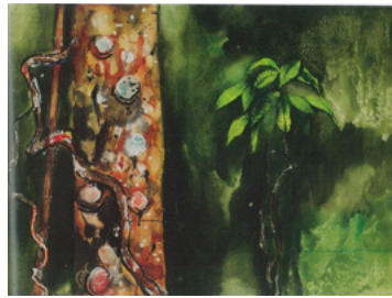
Springbrook 1973 synthetic polymer paint and watercolour on cardboard 30 x 40 cm Private collection, Melbourne