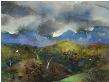
Springbrook Landscape c.1971 watercolour, synthetic polymer paint and pastel on paper 29.4 x 38.8 cm Private collection, Melbourne

born 1914, Melbourne, Victoria. Lived and worked Melbourne. Died 1999