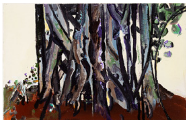
Antarctic Beech Tree Trunks, Queensland 1971 synthetic polymer paint and gouache on paper image 35.3 x 55.3 cm; sheet 76.8 x 55.3 cm Estate of Fred Williams

born 1927, Melbourne, Victoria. Lived and worked in Melbourne, and in England 1951–56. Died 1982, Melbourne