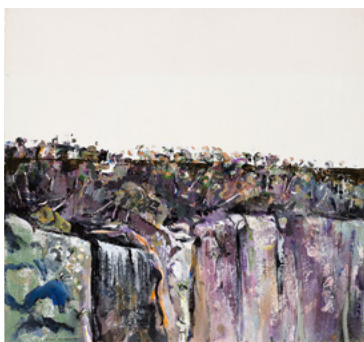
Cliff Face, Springbrook I 1971 synthetic polymer paint and gouache on paper image 40.5 x 55.5 cm; sheet 77 x 55.5 cm Estate of Fred Williams