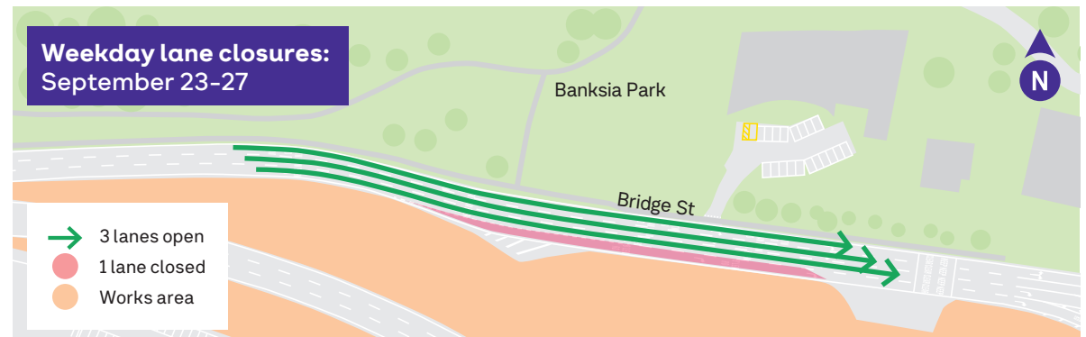
Lane closures will take place between 6am on Monday and 6am on Friday. Delays of up to 10 minutes are expected during these times.