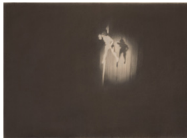
At the Tivoli, 1940 2025 pastel on velvet paper 56 x 76.5 cm