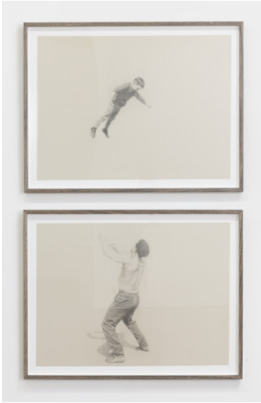
Everything right now 2017 pastel on velvet paper 2 panels, each 56 x 76 cm

Born 1969, Ngambri and Ngunnawal Country/Canberra, Australian National Territory