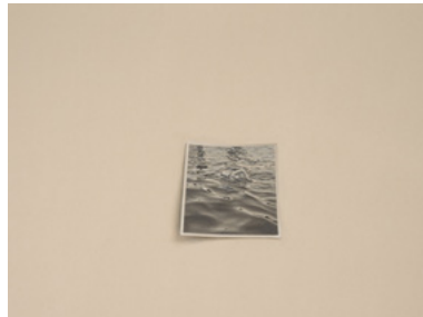
More or less alone in the world 2024 pastel on velvet paper 56 x 76 cm