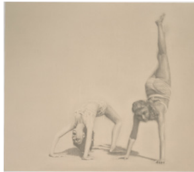
There is nothing in the world I couldn't do 2025 pastel on velvet paper 76.5 x 87.5 cm