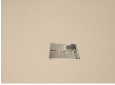
I think it's better we wait till after the war 2025 pastel on velvet paper 65 x 76.5 cm