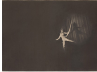
The Spanish Web 2025 pastel on velvet paper 56 x 76.5 cm