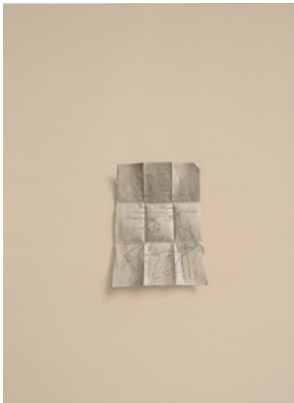
Joy's list 2025 pastel on velvet paper 76.5 x 56 cm