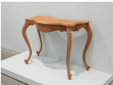
Merric's table 2025 mahogany 74 x 108 x 51.5 cm