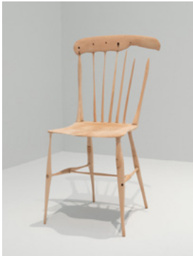
Joy's chair 2025 maple 86 x 45 x 45 cm