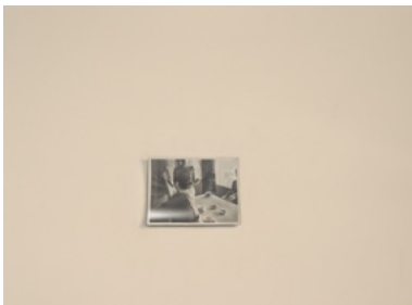
21 flying fortresses came over here very low yesterday 2025 pastel on velvet paper 56 x 76.5 cm