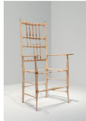
Heide dining chair 2025 oak 110 x 57.5 x 54.5 cm