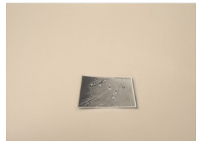
I feel happy now and love everything 2025 pastel on velvet paper 56 x 76.5 cm