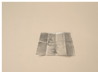
Bert to Grey 2025 pastel on velvet paper 56 x 76.5 cm