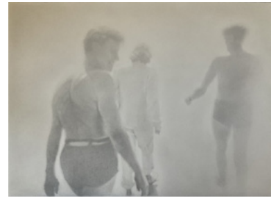
He could feel those things I feel 2025 pastel on velvet paper 56 x 76.5 cm