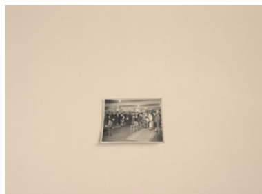
Establishing the Three Little Aussie Painters 2025 pastel on velvet paper 56 x 76.5 cm