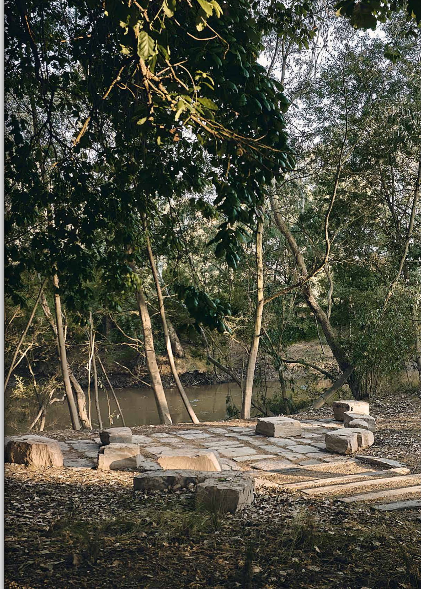
Yaluk Langa gathering space

The next phase of work will include revegetating the area around the gathering space with indigenous species including sub-aquatic plants and plants that are traditionally used for food, medicine, and cultural practices such as weaving. Together with our Wurundjeri friends we continue to nurture Yaluk Langa as an accessible and culturally safe space along the Birrarung for learning, ceremony, cultural knowledge sharing, storytelling and Reconciliation.