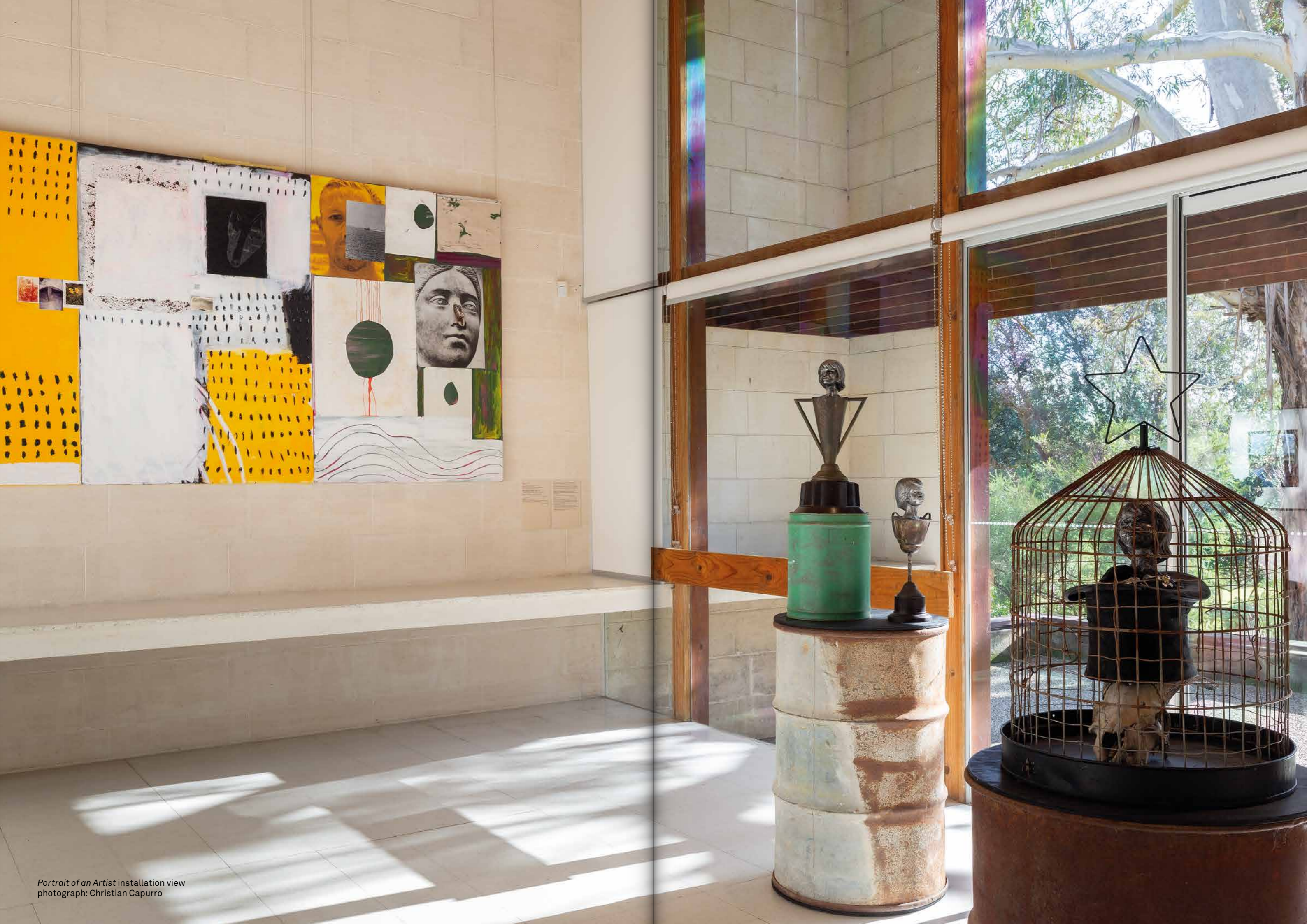
Portrait of an Artist installation view