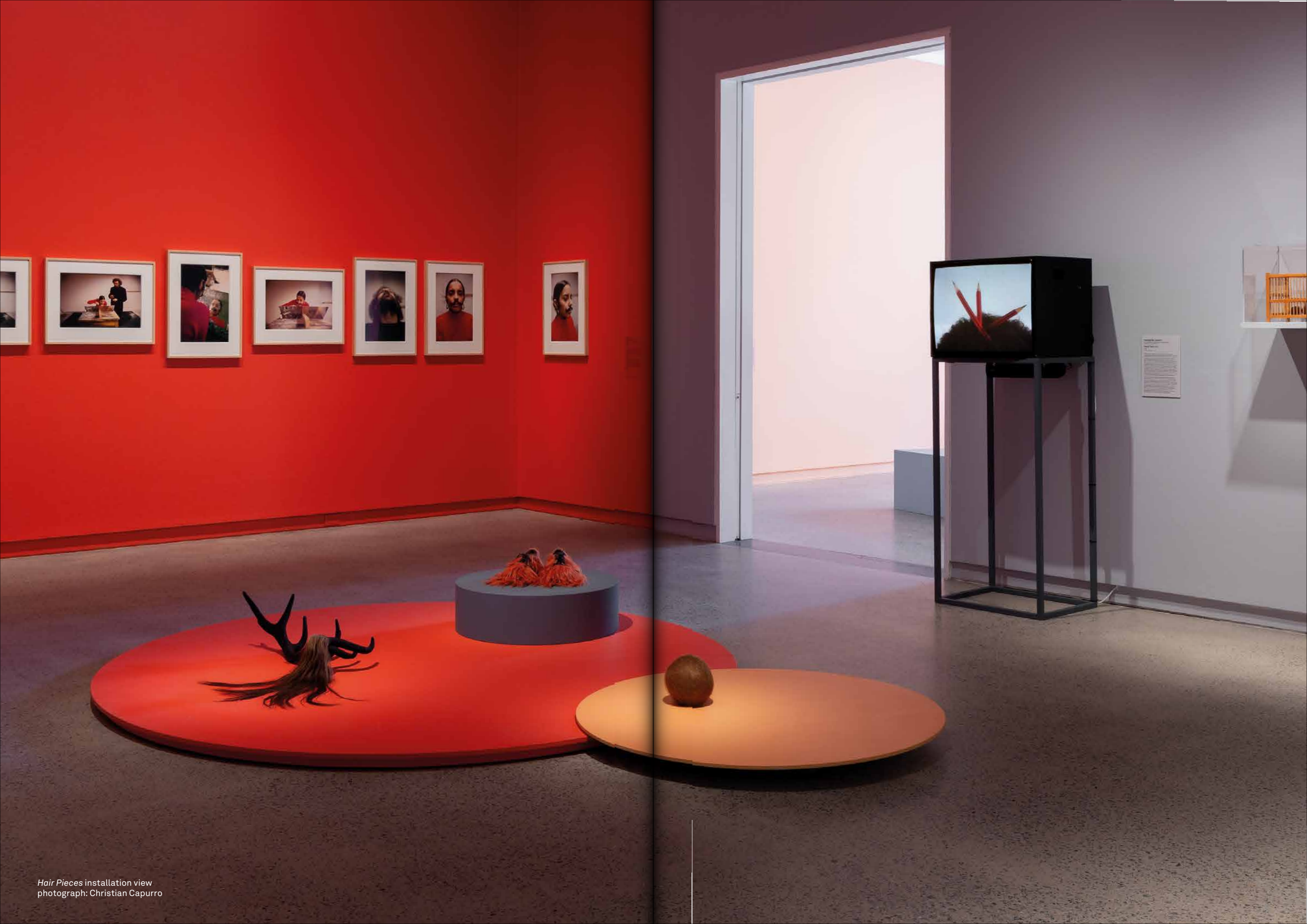
Hair Pieces installation view