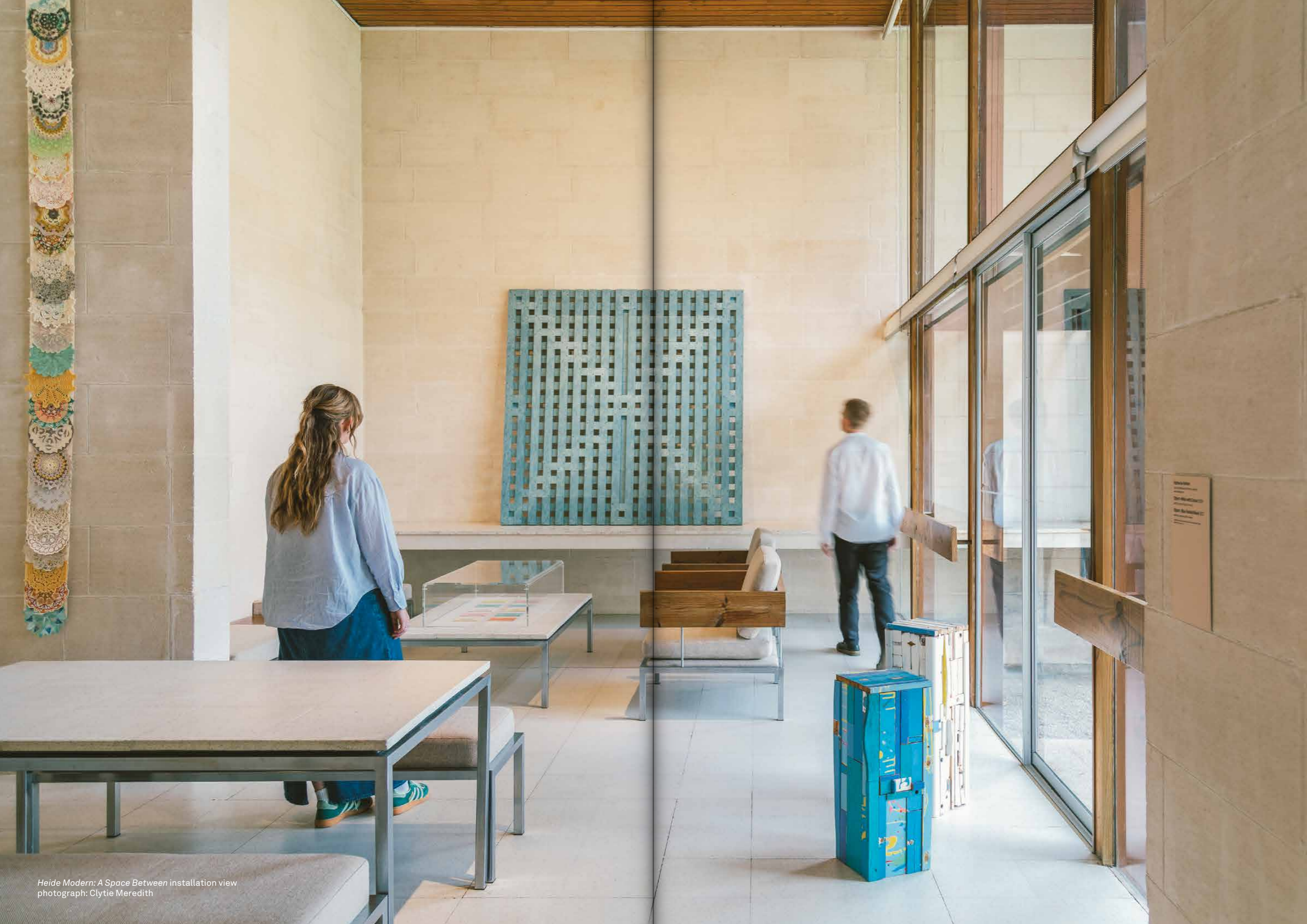
Heide Modern: A Space Between installation view