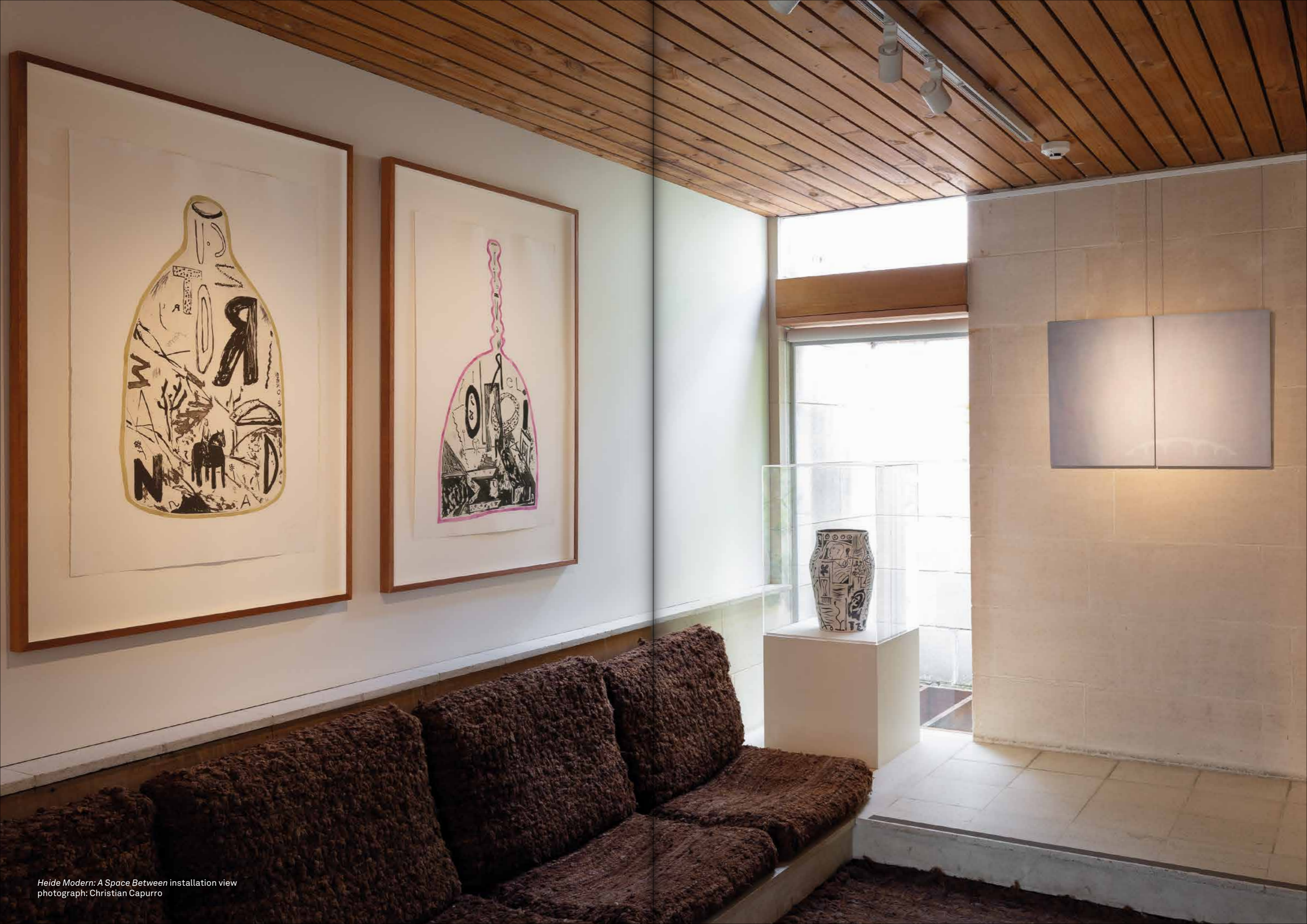
Heide Modern: A Space Between installation view