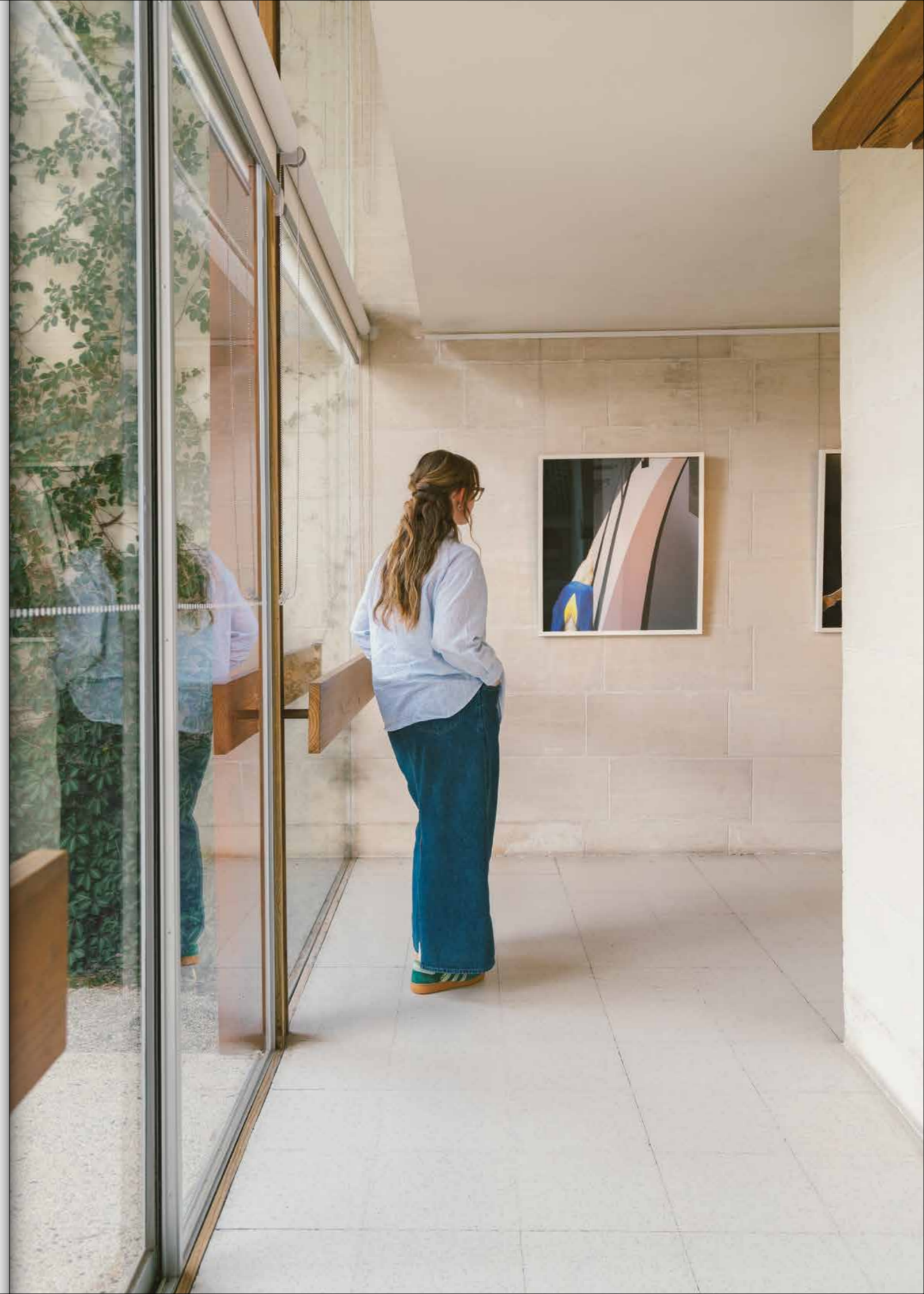
Heide Modern: A Space Between installation view

The human body, distorted, exaggerated and mutilated, provided Tucker with a focus for his unsettling images. His idiosyncratic visual language linked his paintings across time and a range of subjects, and included a red crescent mouth, disfigured nose, stigmatic wounds, and truncated, protoplasmic torsos. This interest in the corporeal was applied to the mythological anti-heroes of his later works and also became his entry point to Australian landscape painting in the 1950s. His depiction of open wounds scarring the ancient desert channelled feelings of despair and anxiety and generated a uniquely antipodean adaptation of the grotesque that has made his work highly distinctive and identifiable today.