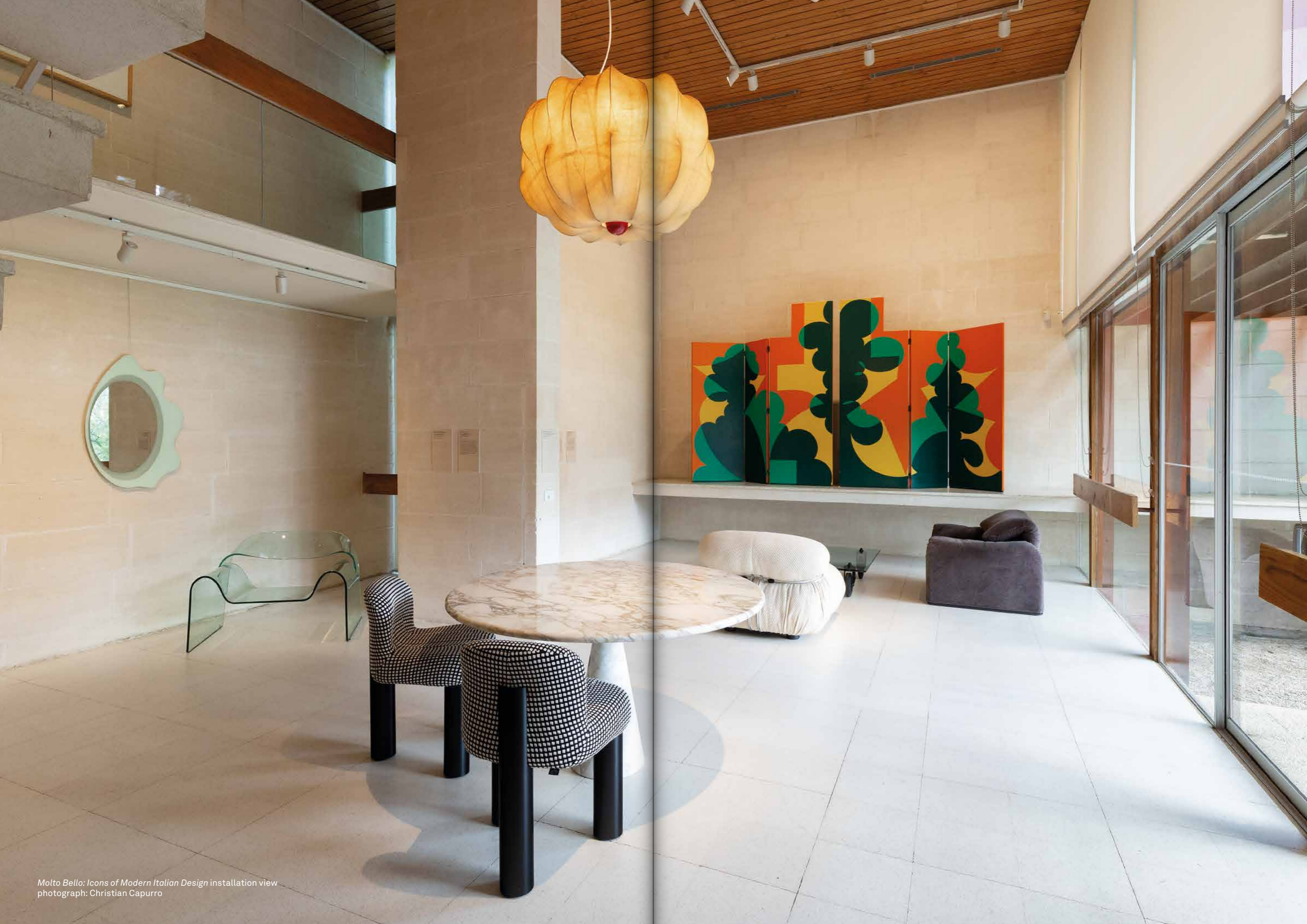
Molto Bello: Icons of Modern Italian Design installation view