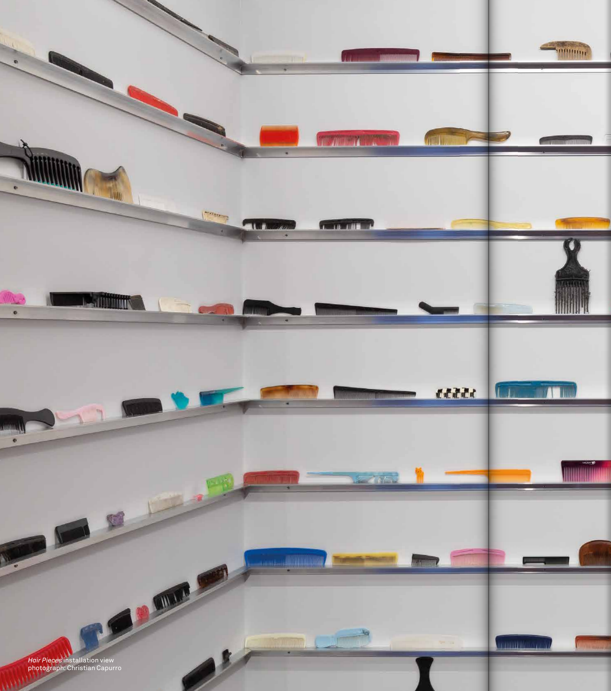
Hair Pieces installation view