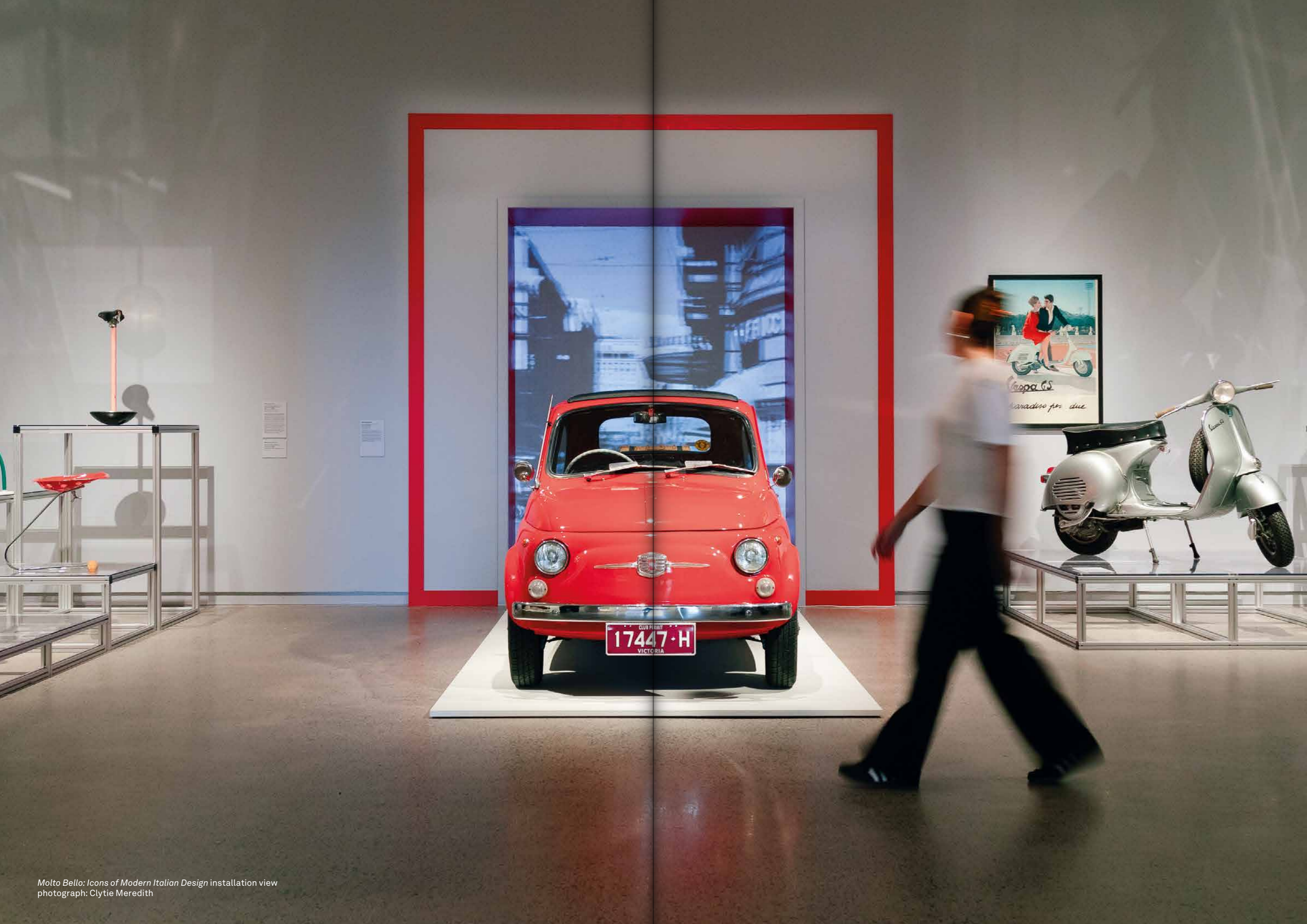
Molto Bello: Icons of Modern Italian Design installation view