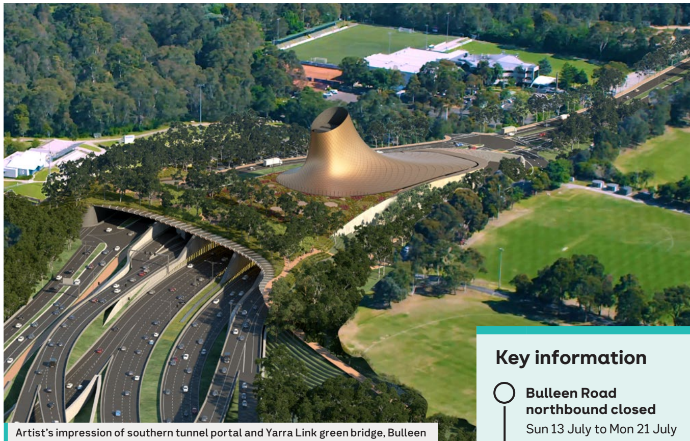
Artist's impression of southern tunnel portal and Yarra Link green bridge, Bulleen

We're connecting the North East Link tunnels to the Eastern Freeway and building the Yarra Link green bridge. To keep traffic moving while we work, we're moving traffic onto the newly completed final alignment of Bulleen Road.